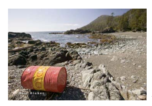
\blacksquare \leftarrow Figure 4. Gas and oil pollution