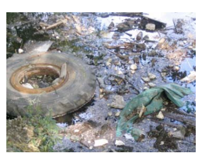
Figure 3. Waste pollution \rightarrow