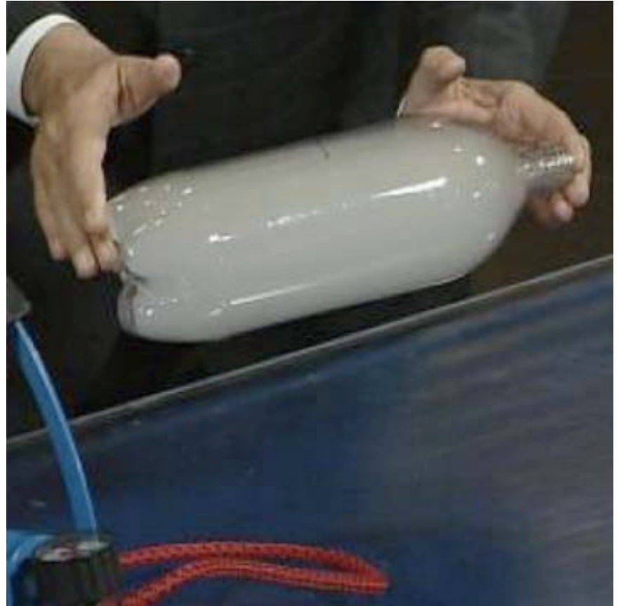
Figure 7. Cloud Experiment

I asked the children to repeat to me how clouds are made and formed. After this quick review, I preceded to perform the clouds in a bottle experiment. The experiment is outlined as follows: