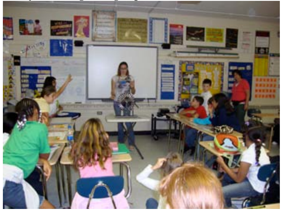
Figure 8. Synthetic Lightening Experiment